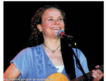
High res digital photos available on request to webmaster@fmshny.org